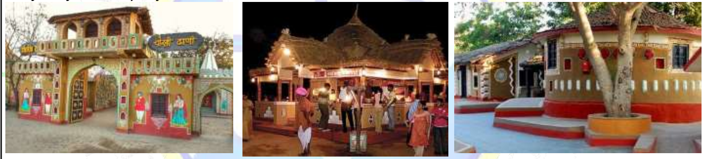
Evening back to Hotel . Overnight at Jaipur

It was established in 1989 and has been serving local and international tourists since 1994. It has machines & different platforms for performing artists. It also holds mini village fairs occasionally. Alongside, it is also a 5-star luxury hotel with Royal Cottages, Cottage Rooms and Haveli Suits for tourists to choose from, based on their needs. The resort has a royal décor with ancient relics, vintage furnishings and gives the luxurious look and feel of olden day Rajasthan.